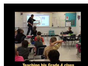
Teaching his Grade 4 class