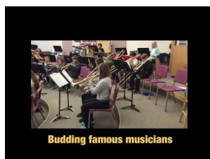
Budding famous musicians